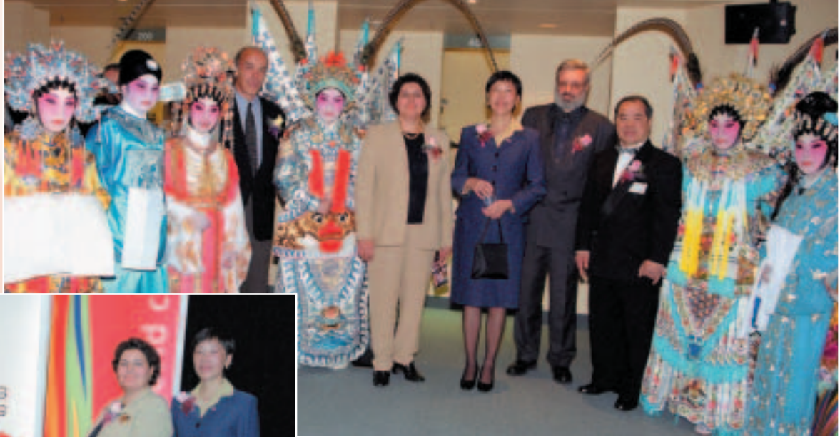
Officiating guests of "A Cultural Rendezvous with Hong Kong" meet with the leading performers of Canada (KW) Music & Arts Centre at the opening ceremony of the Hong Kong Promotion on October 2.