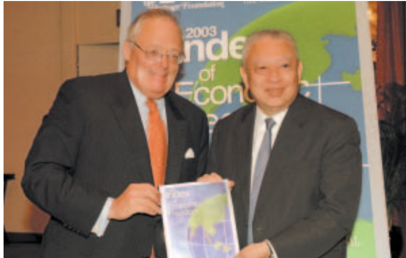
The Chief Executive, Mr Tung Chee Hwa, receives a copy of the Heritage Foundation's 2003 Index of Economic Freedom from its President, Dr Edwin Feulner, on November 12. Hong Kong is again ranked as the world's freest economy in this year's Index.

Commenting on the report's findings, a government spokesman said: "We remain firmly committed to maintaining Hong Kong as a free market economy. We will always look for ways to let the market operate freely, and to unleash the vitality and creativity of enterprise and individual endeavour." He continued: "Yet we recognize that the Government does have an important role to play to enable the market to work better and the economy to further flourish. This role complements, not displaces, private sector initiative so that the growth potential could be best pursued."