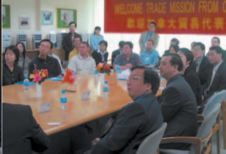
The Hong Kong-Canada Trade Mission visits Dongguan and Shenzhen in the Pearl River Delta region to see how factories owned and managed by Hong Kong companies are run.