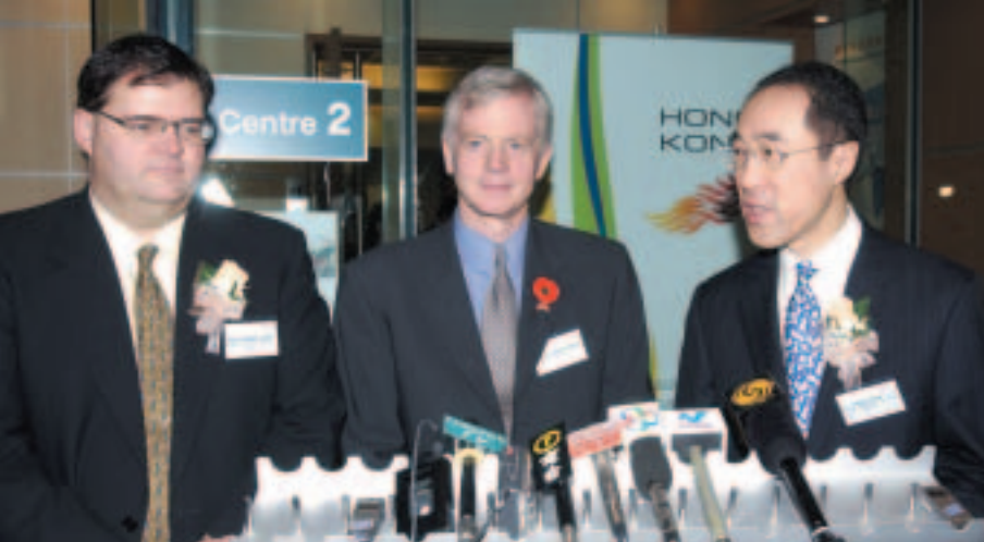
(From right to left) The Secretary for Commerce, Industry and Technology, Mr Henry Tang; the Canadian Secretary of State (Asia Pacific), the Hon David Kilgour; and the Alberta Minister of Economic Development, the Hon Mark Norris, meeting the media after the opening of the Hong Kong-Canada Trade Mission Conference.