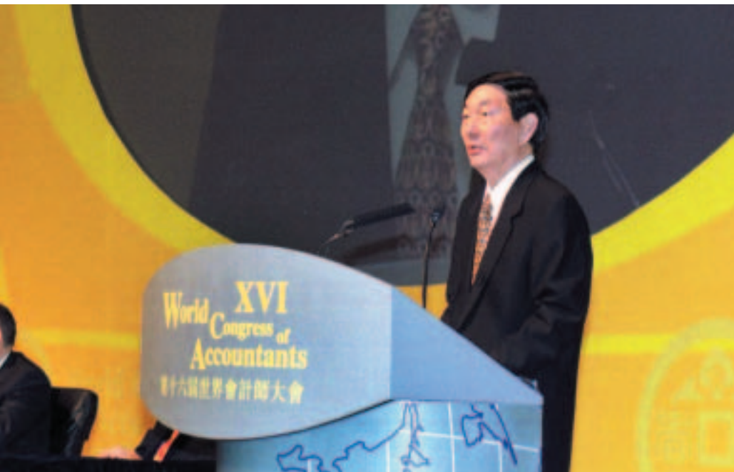
Premier Zhu Rongji delivers his speech at the opening of the 16th World Congress of Accountants at the Hong Kong Convention and Exhibition Centre on November 19.

The Premier of the People's Republic of China, Premier Zhu Rongji, expressed full confidence in Hong Kong when he addressed the opening ceremony of the 2002 World Congress of Accountants on November 19 at the Hong Kong Convention and Exhibition Centre.