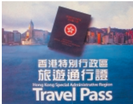
HKSAR's Travel Pass provides greater travel convenience.

Singapore was rated the second freest economy, followed by the United States, the United Kingdom, New Zealand, Switzerland, Ireland, Australia, Canada and the Netherlands.