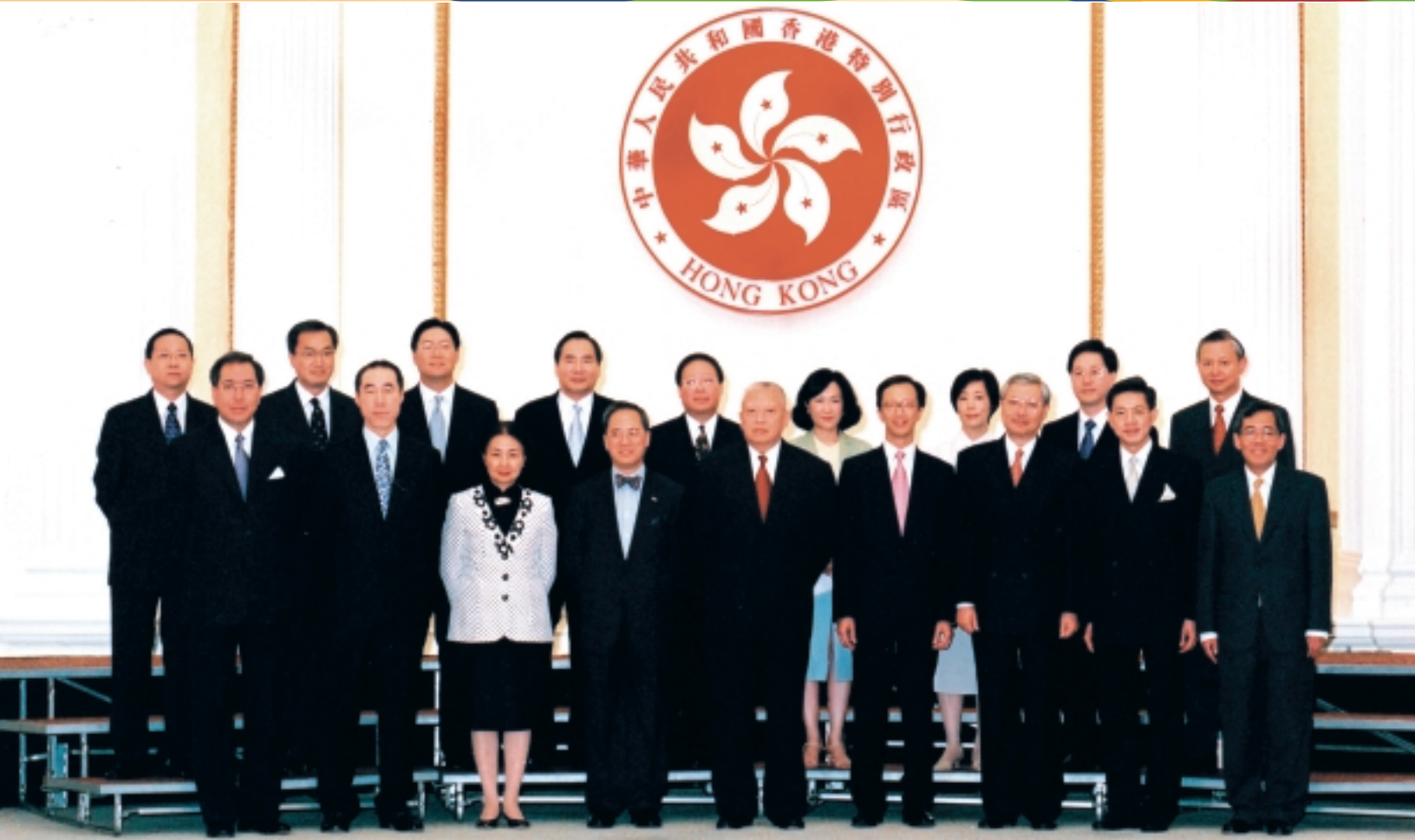
The Chief Executive, Mr Tung Chee Hwa, with the Principal Officials and heads of disciplinary services under the accountability system.

Hong Kong Economic and Trade Office • Toronto June 2002 Issue